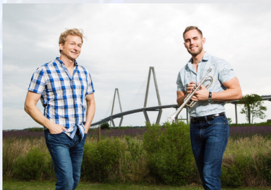
SATURDAY, JANUARY 27, 3:00PM DEUX VOIX, TRUMPET AND ORGAN $20.00 PER PERSON