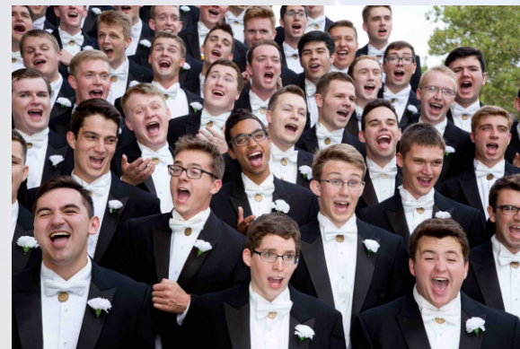
FRIDAY, MARCH 16, 7:00PM PURDUE MEN'S GLEE CLUB $20.00 PER PERSON